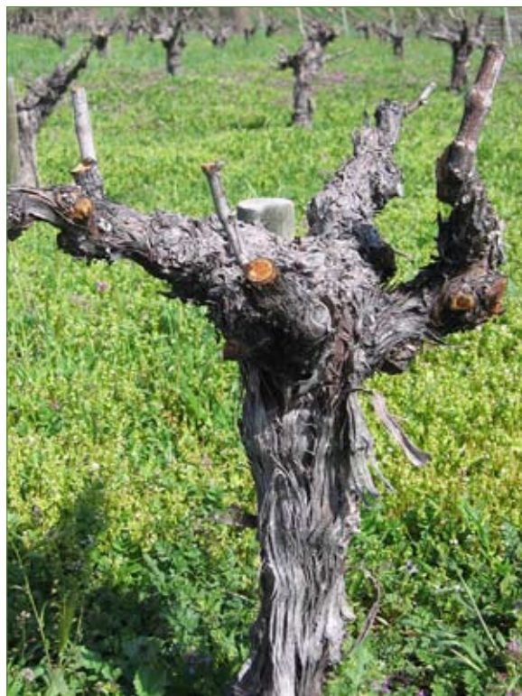
A head-pruned Mourvèdre vine

One experiment that has shown some promise has been our decision to plant small head-pruned blocks of vines in several of the flatter, lower-lying areas such as the Mourvèdre block between the winery and Adelaida Road. We created several other head-pruned blocks in vineyard that we reclaimed from rootstock when we outsourced our nursery operation to NovaVine in 2004. That effort accelerated when we planted Scruffy Hill (the vineyard block on the other side of Tablas Creek) in the winters of 2005-2006 and 2006-2007. At this point, we have about eighteen acres of head-pruned vines, scattered around the vineyard.