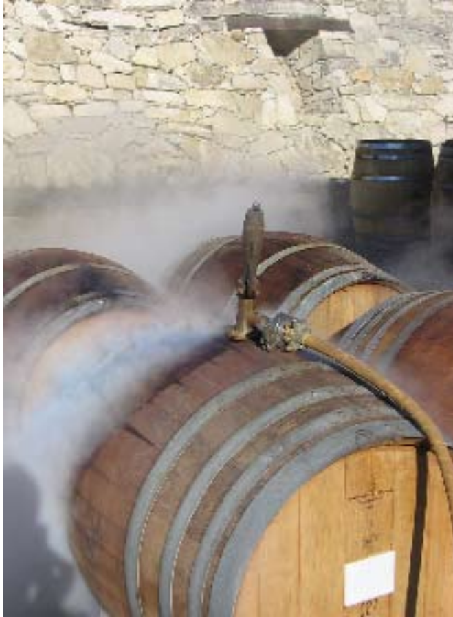
Steam-cleaning barrels outside the winery.

Three factors, at least, led to the low yields. First was drought. We had our third consecutive drought year in Paso Robles, with rainfall totals last winter only about 60% of normal. Second was frost. We had our most damaging frost since 2001, impacting an estimated 35% of the vineyard. Third was dehydration. The heat spike in September caused dehydration of the